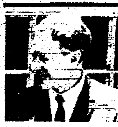
Rhodesian Premier Smith

SALISBURY (Cm)—Like a vast underworld beginning stir, Rhodesia's Africans are showing resistance to the Anglo-Rhodesian settlement proposals to extent which is causing serious concern to the Prime Minister, Mr. I. Smith. Both among the relatively sophisticated urban African population and the mass of peasants in the tribal trust lands, where three-quarters of the African people live, there is an unexpected degree of opposition which has taken not only Rhodesian authorities by surprise but also the African nationalists who have been attempting to build opinion against the proposals. Demonstrations are being planned in the African National Council, the largely disguised nationalist organisation formed last year to greet Lord Pearce and commissioners when they hold hearings in Salisbury this month to the African opinion on the proposals, and more protests are being planned during the course of the next two months in the main centres which are included on the commissioner's itinerary. The prospect now confronting the area Commission has changed considerably since the time of Sir Douglas-Home's visit here in November, when no effective African nationalist organisation existed. Political and church leaders beginning to note an increasingly militant mood among much of the African population, given for the first time political power to decide its own future.